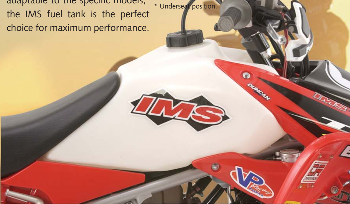
YAMAHA 660 RAPTOR