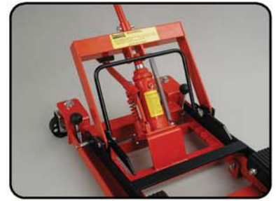
Hydraulic system for elevation