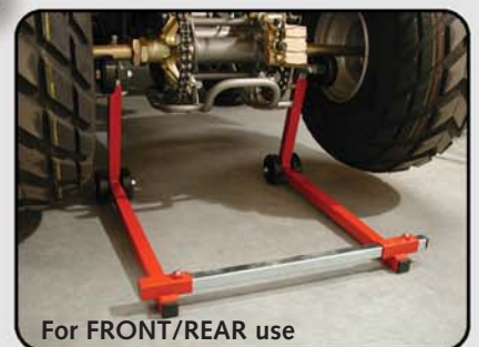
For FRONT/REAR use