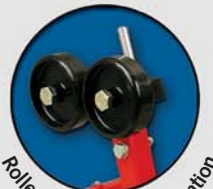
Rollers for easy axle rotation