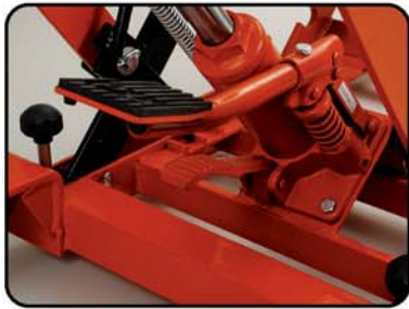
Foot Pedal for precise elevation