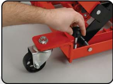
Block for perfect stabilisation